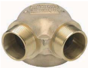
bottom outlet connection 26-296