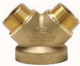
back outlet connection 26-294