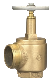
female x male 18-157