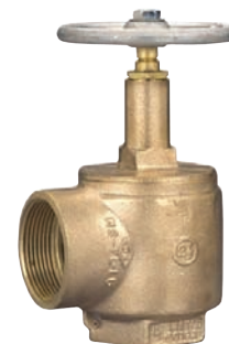
female x female 18-158