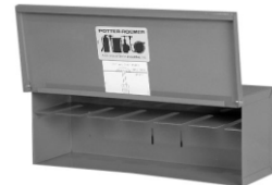
SPARE HEAD BOX MODEL 6162