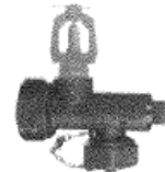
LINE TESTER MODEL 6175